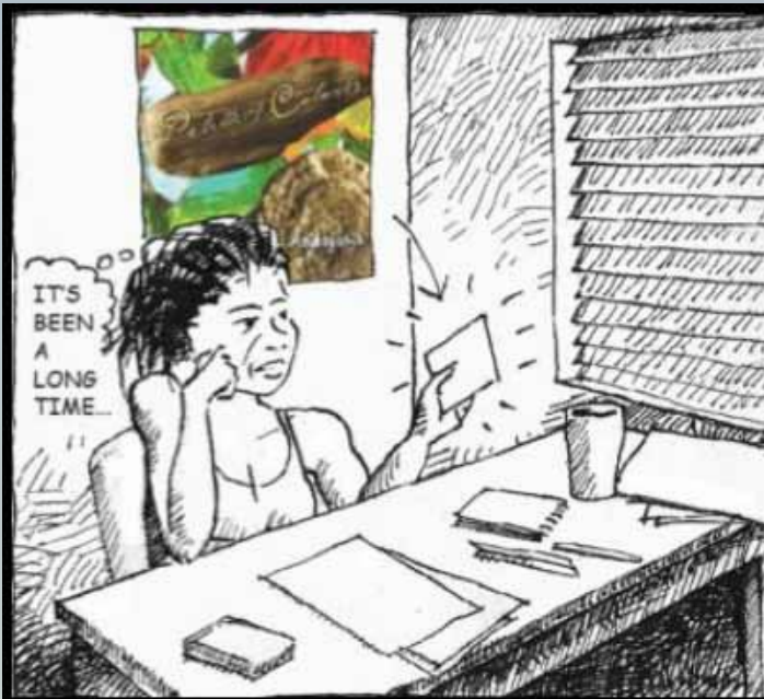
illustration by Renaud Rolland